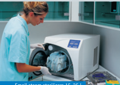
Small steam sterilizers 15-25 l