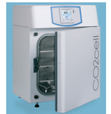
CO2cell 50 Standard