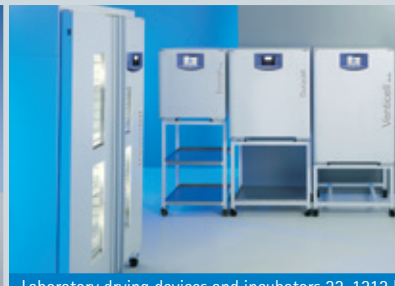
Laboratory drying devices and incubators 22-1212 l