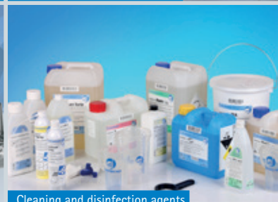
Cleaning and disinfection agents