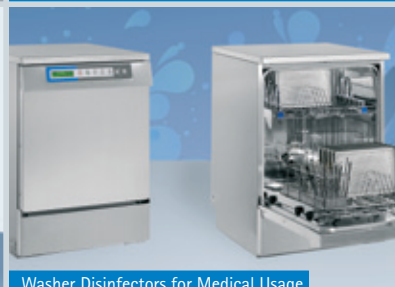
Washer Disinfectors for Medical Usage