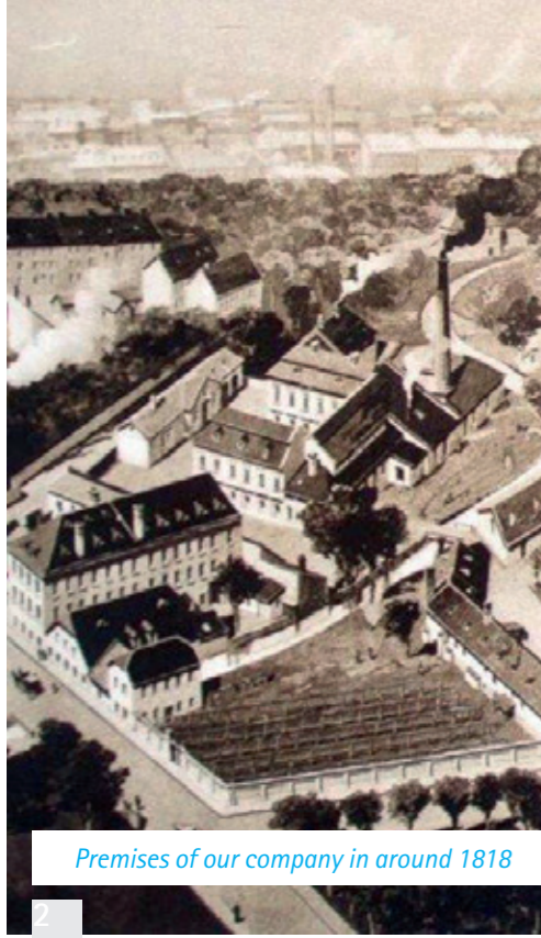
Premises of our company in around 1818

In 1992, the company became a member of the European MMM Group, which has been operating on the world market since 1954 as a major supplier of systems in the service of health, science and research. With its comprehensive range of products and services, sterilization and disinfection facilities for hospitals, scientific institutes, laboratories and the pharmaceutical industry, the MMM Group has established