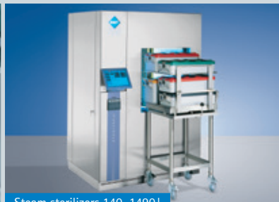
Steam sterilizers 140-1490 l