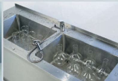
Stainless steel instrumentation