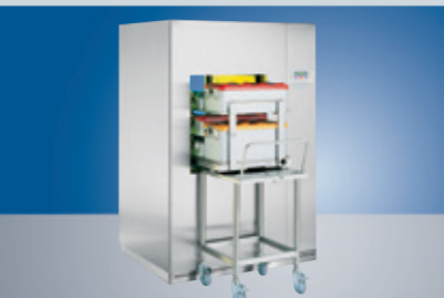
Large steam sterilizer 73-1490 I