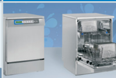
Washer disinfectors for medical usage