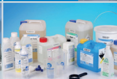
Cleaning and disinfection agents