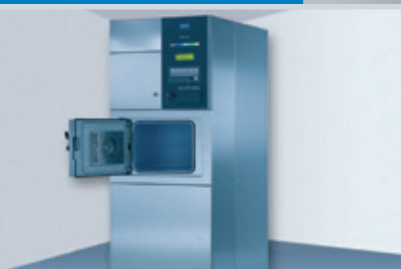
Formaldehyde sterilizer 110 I