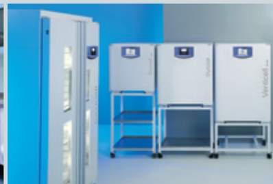
Laboratory drying devices and incubators 22-1212 I