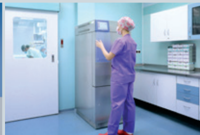
Steam sterilizer 70 I