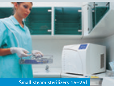
Small steam sterilizers 15–25l