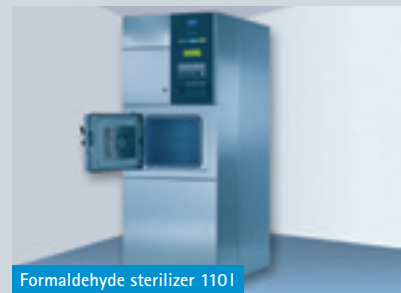
Formaldehyde sterilizer 110l