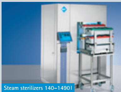
Steam sterilizers 140–1490l