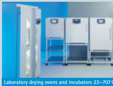
Laboratory drying ovens and incubators 22–707l