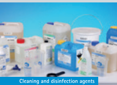
Cleaning and disinfection agents

To protect, treat and lubricate the stainless steel surfaces, we recommend you the special products neoblank or neoblank Spray . The products are sprayed evenly on the stainless steel surface and polished by a smooth cloth. The surface is evenly clean and semi-bright, without any finger-prints, smears or stains. To clean stubborn stains off the stainless steel surface thoroughly, neodisher sol is recommended. neodisher sol is a cleaning dispersion which removes efficiently the scale, grease and other dirt difficult to remove. The use of such special products will markedly improve the stainless steel products appearance and will extend their life. Use the following contacts to get more information about the products.